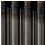
raw steel lacquer